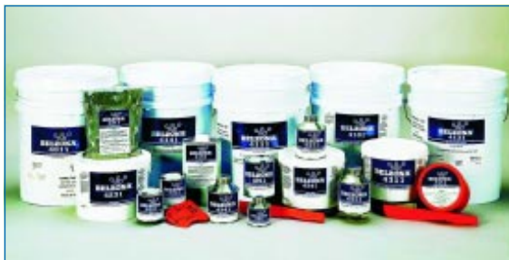
BELZONA® 4000 SERIES MAGMA POLYMERS