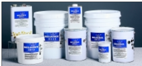
BELZONA® 3000 SERIES POLYMERIC MEMBRANES