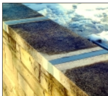
PARAPET WALLS & COPING STONE JOINTS