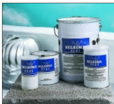
AVAILABLE IN 1 LITER (33.8 OZ) AND 4 LITER (1.06 GALLON) UNIT SIZES