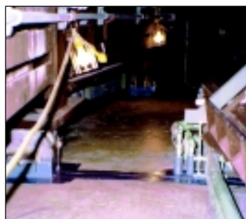
JOINTS & SEAMS