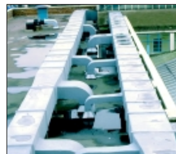
AIR CONDITIONING & VENTILATION EQUIPMENT