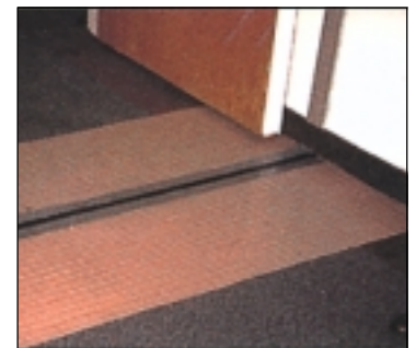
REPAIR EXPANSION JOINTS