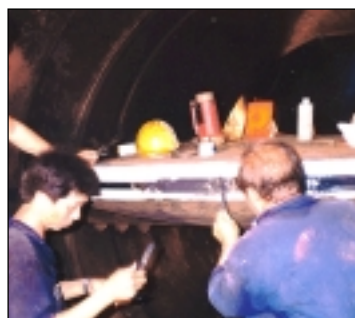
FORM VALVE SEALS