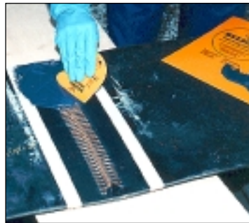
SEAL CLIP JOINTS

These versatile multi-purpose elastomers make cost effective repairs possible for large and small jobs alike. They are the ideal choice for applications demanding a high performance elastomeric sealant.