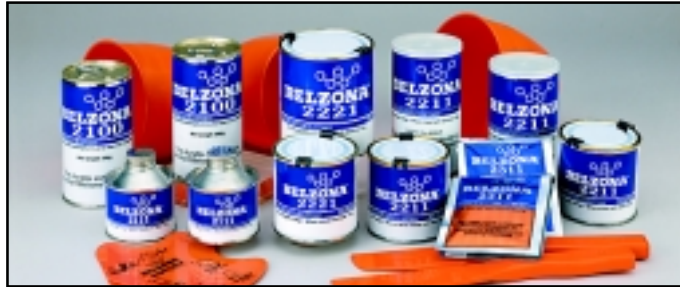
BELZONA® 2000 SERIES ELASTOMERIC POLYMERS