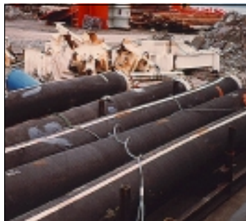
REPAIR FLOATING HOSES